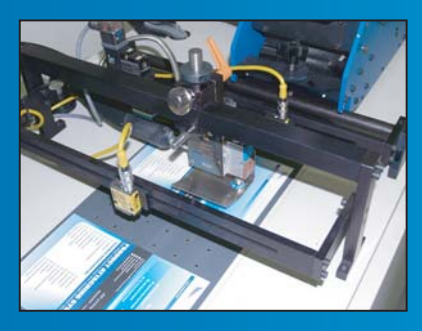
Lorem ipsum dolor sit amet, consectetur adipisicing elit, sed do eiusmod tempor incididunt ut labore et dolore magna aliqua.